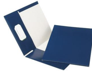
1 plastic report cover with pockets