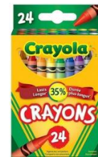
Crayola 24 pack crayons