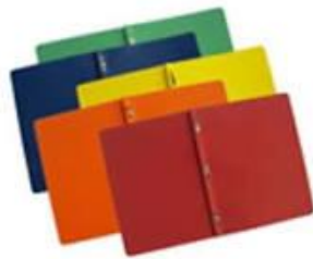
4 Duotangs (1 each red, blue, yellow, green)