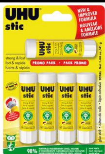
4 LARGE glue sticks