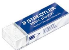
2 white Staedtler erasers