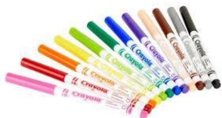
Crayola 12 pack washable felt markers