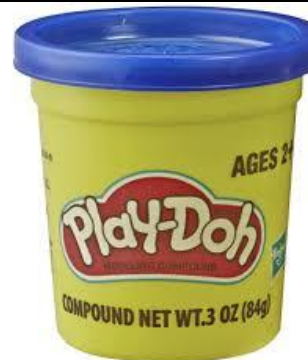
1 can Play-Doh brand (any colour)