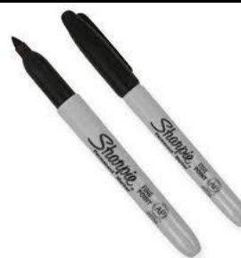
2 black fine point sharpie