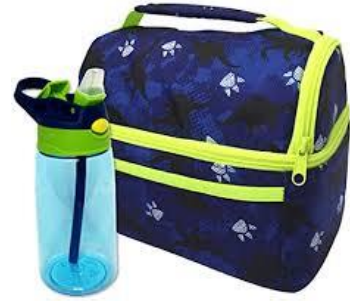
Water bottle and lunch kit