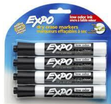
4 black dry erase markers