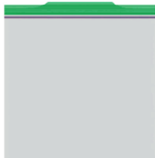
2 large and 4 sandwich size Ziploc bags