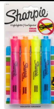
4 highlighters – blue, pink, orange, yellow