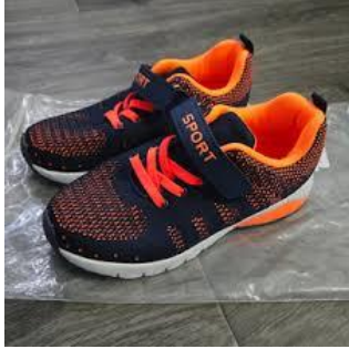
Non-slip inside shoes (NO LACES)